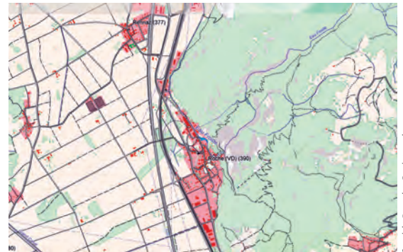
A vector dataset from swisstopo.

FME complements both the ArcGIS Desktop and ArcGIS Server environments. FME enables ArcGIS Desktop users to extend the geoprocessing tools to author spatial ETL tasks, and it enhances the ArcGIS Server geoprocessing tools to enable users to acquire tools and datasets in the precise format and data model they need. Acting as the dataHub's nerve center, FME takes in all data requests and